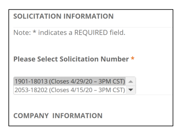
Step 2. Enter your company information:

Step 1. Select the solicitation you are submitting a Bid/Proposal/Qualification for by clicking on the corresponding solicitation number. Once a solicitation number has been selected, it will be highlighted: